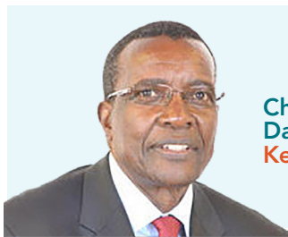
Chief Justice (Emeritus) David K. Maraga, FCI Arb, EGH Kenya

Chief Justice (Rtd) David Kenani Maraga was the Chief Justice and President of the Supreme Court of Kenya from 2016 to 2021 during which he also served as the Chairman of the Kenyan Judicial Service Commission; Chairman of the National Council on Administration of Justice; and Chairman of the Council for Law Reporting. Prior to joining the Judiciary, Justice Maraga was in private practice for over 25 years.